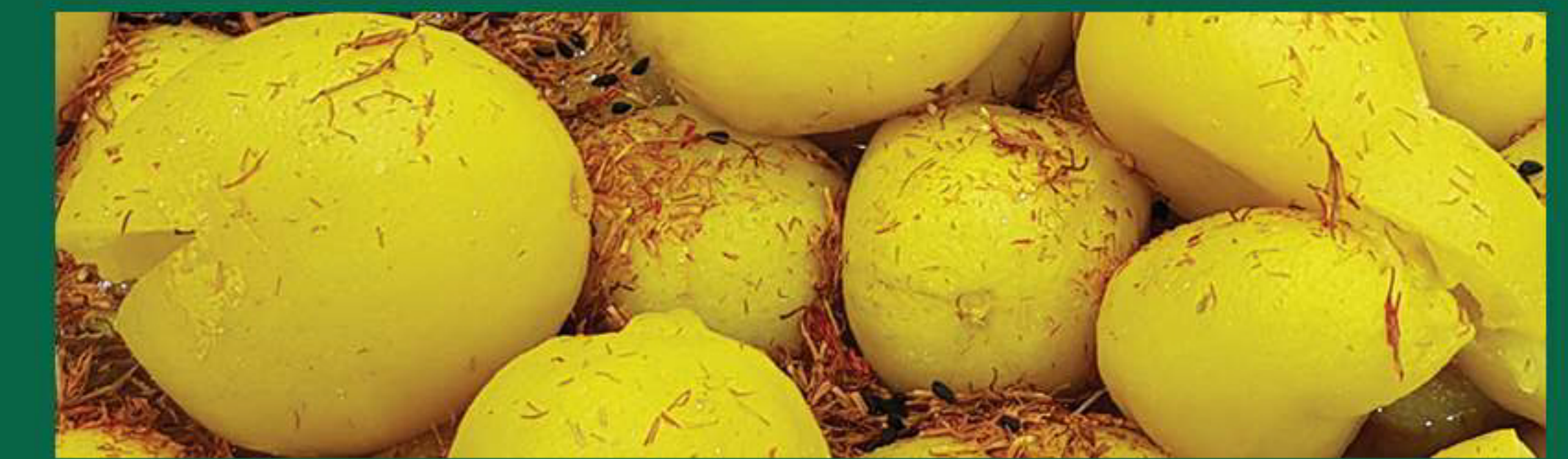
Pickled Lemon with Herbs