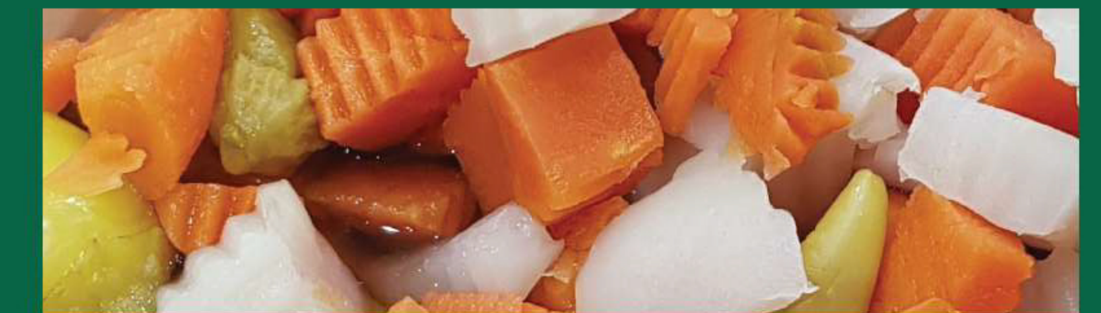
Mixed pickled vegetables