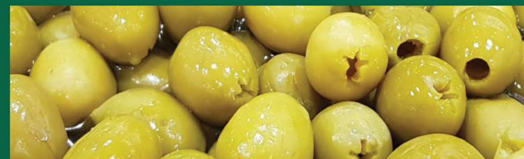
Pitted Green Olives