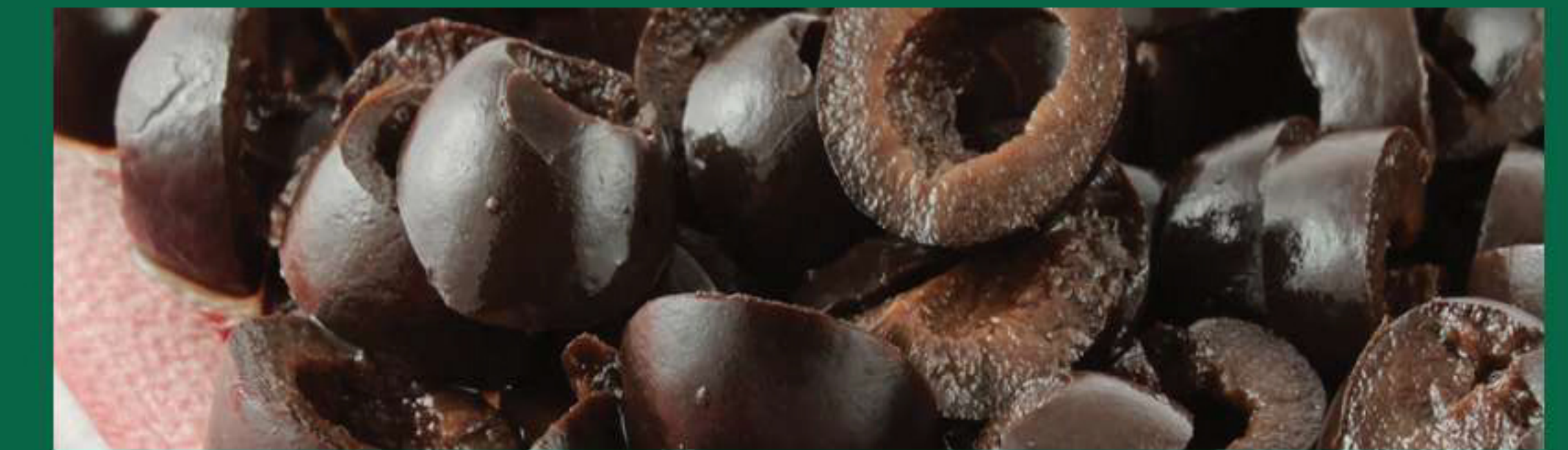
Sliced Oxidized Olives